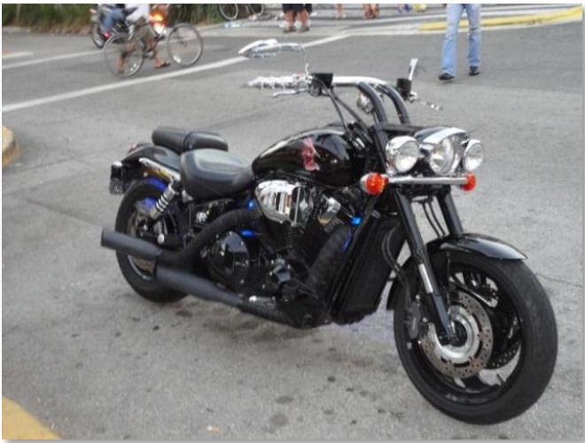
A motorcycle like this was found on the beach in Haida Gwaii