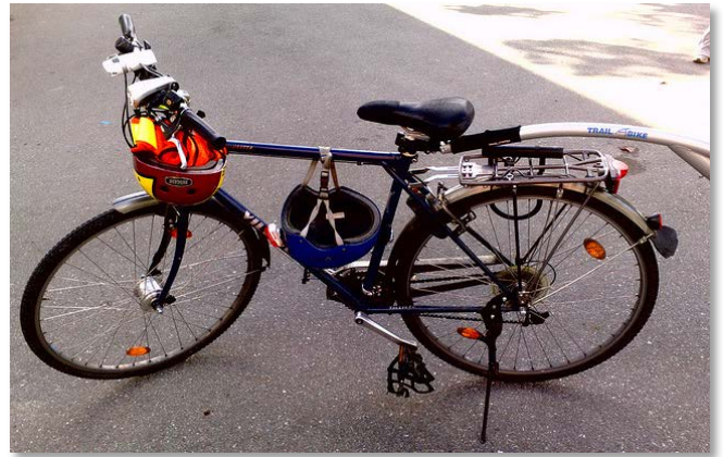
A bicycle on a street