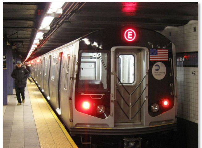
A subway underground