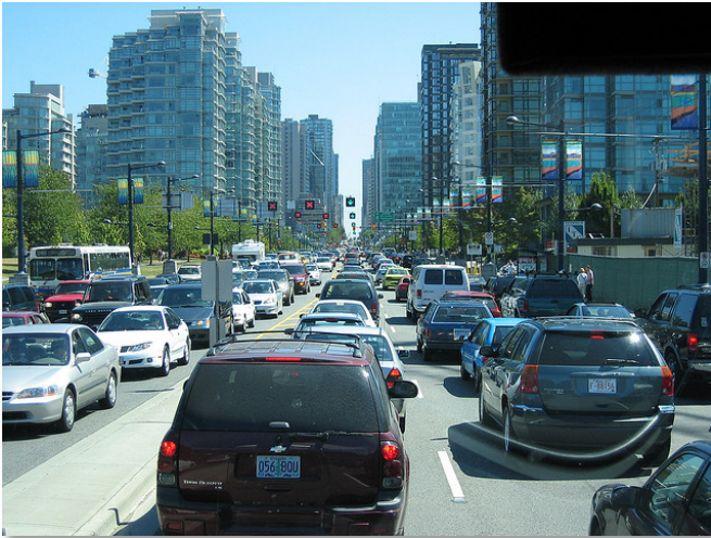
A traffic jam in Vancouver