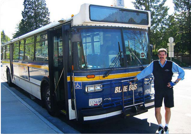
A bus driver waits for passengers.