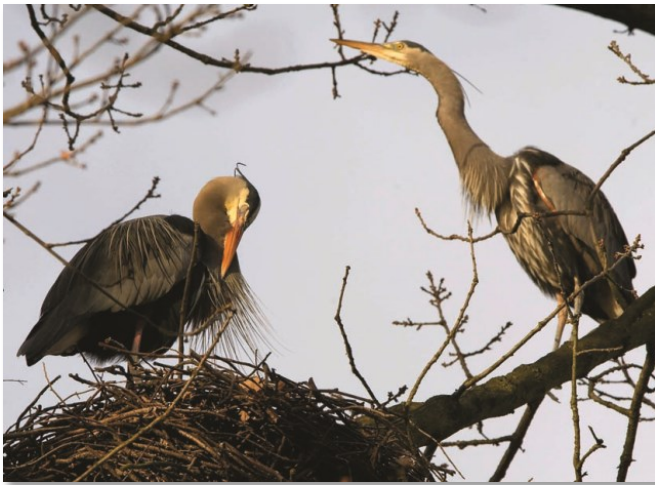
Hérons in a tree