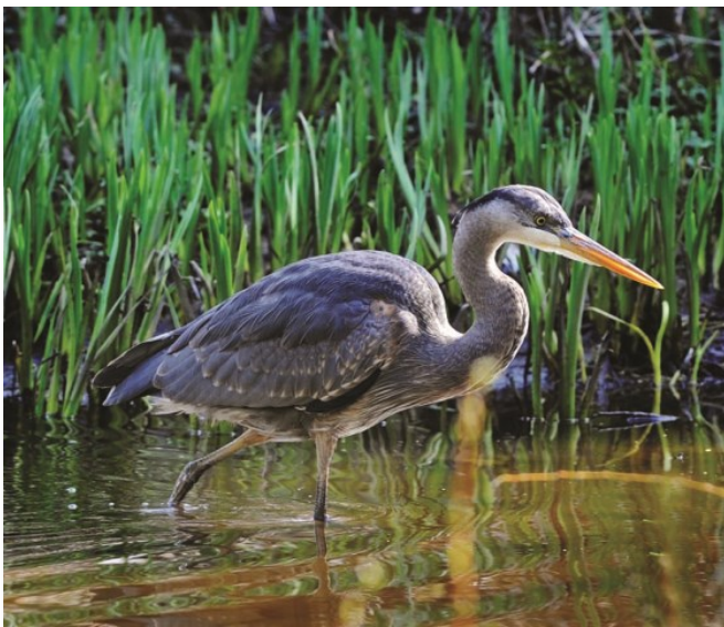
A young heron looks for food.