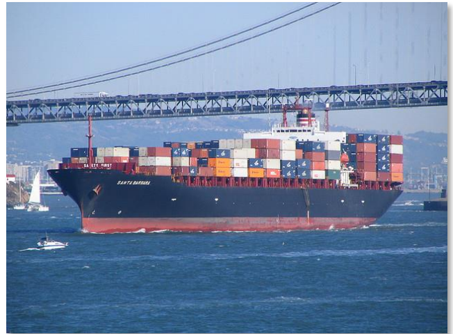
A ship loaded with containers

Shipping containers hold goods shipped by train, truck and ship.