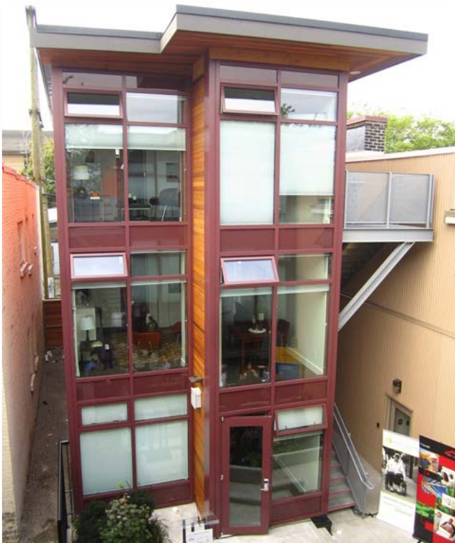
View of the outside of the new apartment building