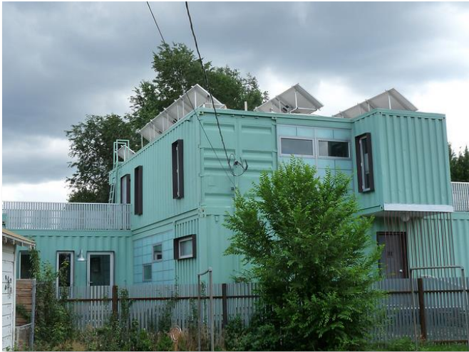
A shipping container house in Flagstaff, Arizona

Shipping containers can be made into lots of different things.