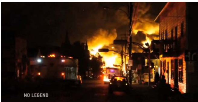
Downtown on fire