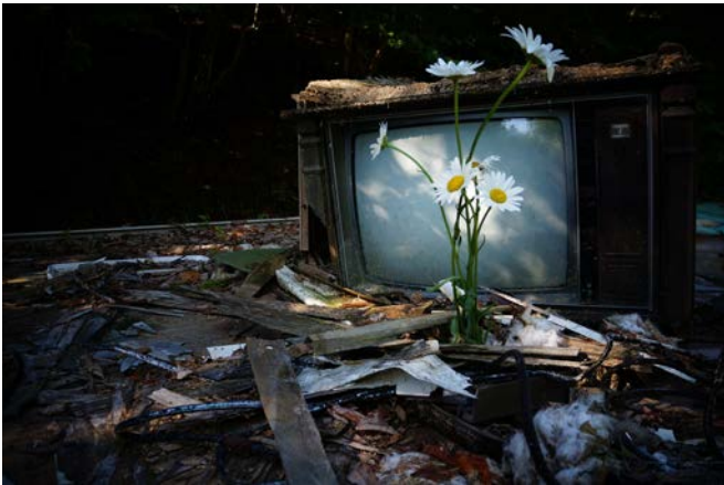
TV and Daisy

A house destroyed by the fire left only this TV. The daisy symbolizes patience and simple beauty.