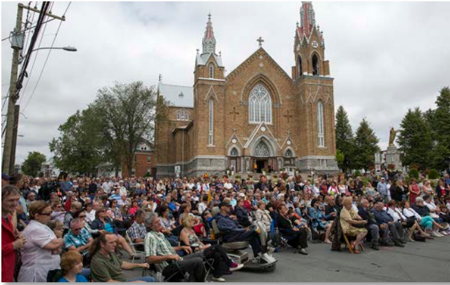
A memorial service was held for the whole town.