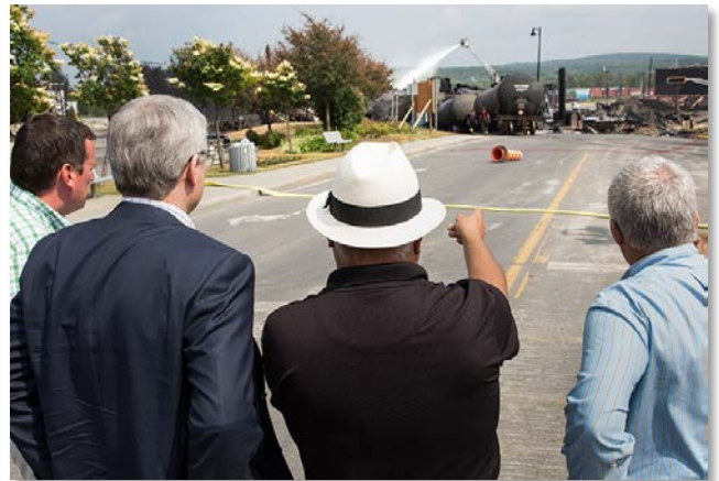
Prime Minister Harper looks at the damage.

People without homes had to stay at the high school. Friends and neighbors bought food, diapers, toys and clothes.