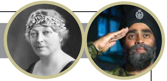
PHOTOS — JULIA: CITY OF VANCOUVER ARCHIVES P1073; HARJIT: WARD PERRIN/THE VANCOUVER SUN

Find a word from the word bank which has the opposite meaning of each word below.