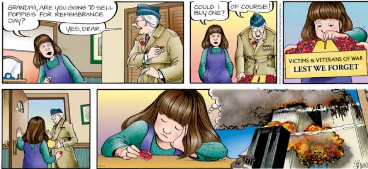
FOR BETTER OR FOR WORSE © 2001 LYNN JOHNSTON PRODUCTIONS. DIST. BY UNIVERSAL UCLICK. REPRINTED WITH PERMISSION. ALL RIGHTS RESERVED.

Fill in the crossword. Use the four Remembrance Day words in the word bank.