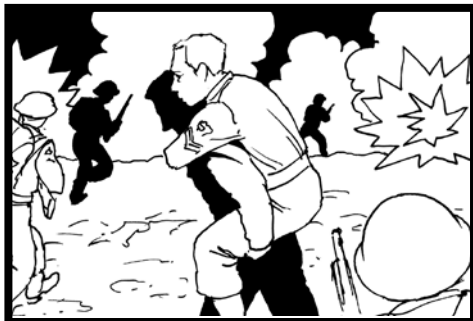
ILLUSTRATION — NOLA JOHNSTON